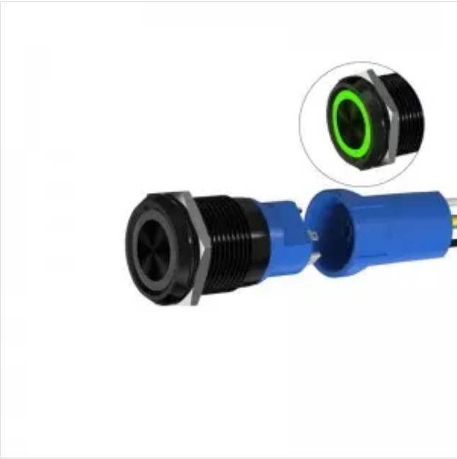
HIGH QUALITY BLACK OXIDE BUTTON 22MM SWITCH RING LED