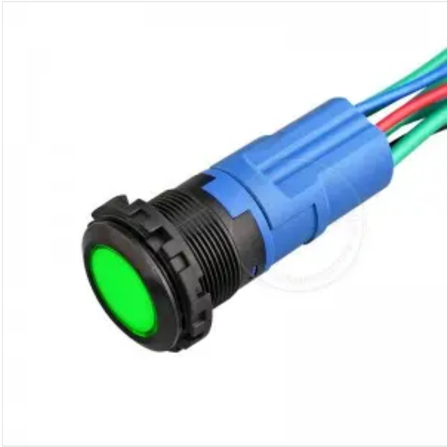
22MM AUTOMATIC SELF RESET BUTTON 10A HIGH CURRENT