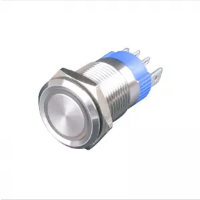
16MM ILLUMINATED PUSH BUTTON RING LED PIN TERMINAL