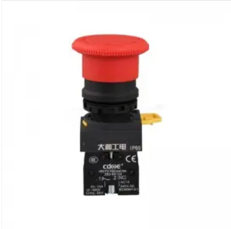
IP65 EMERGENCY STOP BUTTON 22MM ONE NORMALLY OP...