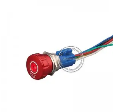
EMERGENCY POWER OFF BUTTON 19MM IP67 BI COLOR P...