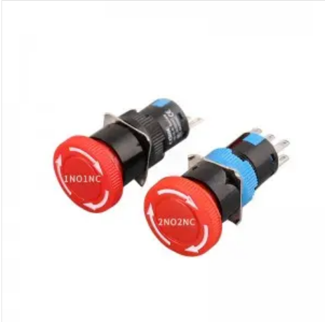
ARROW EMERGENCY STOP 16MM 1NO1NC 2NO2NC PLASTIC...